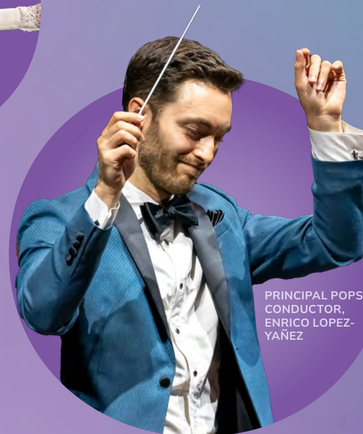
PRINCIPAL POPS CONDUCTOR, ENRICO LOPEZ- YÁÑEZ

Incredible performances are taking center stage - you won't want to miss a single show!